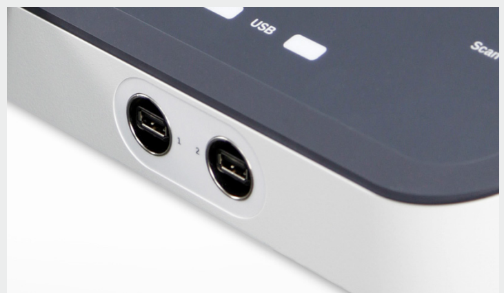
Two USB ports on the front let you take away your scanned images.