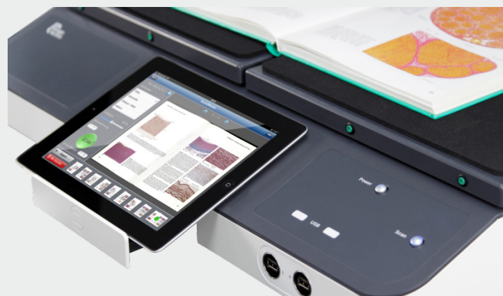
Pad holder for use while operating the scanner with Scan2Pad®

The Bookeye® 4 Kiosk copier has an integrated billing module. This means that for all applications that do not have an existing card or billing system, Bookeye® 4 Kiosk can take over the billing itself. Configurable invoice printing and journaling are standard functions in the Bookeye® 4 Kiosk as well as remote locking and unlocking of the system.